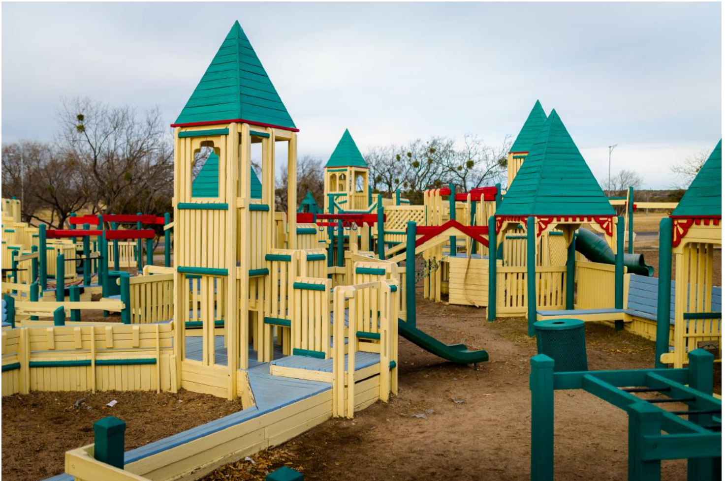
Playground in Comanche Trail Park

Close review of this map shows three developed areas that are not within standard acceptable distances of either a park or playground.