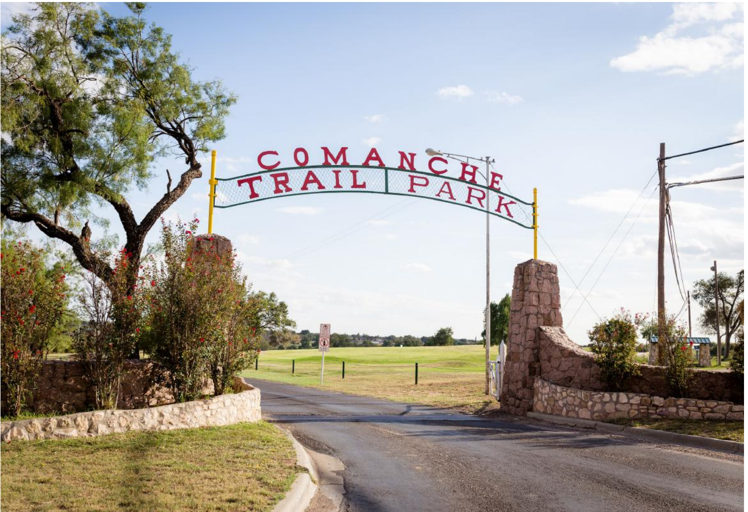
Comanche Trail Park entrance

Using the input received, the city devised a rough outline of what they would like to include in the Master Parks Plan, and held public hearings on November 17, 2021, January 23, 2024, and February 13, 2024. Feedback received from the public hearing and further review was utilized to draft the completed Master Parks Plan.