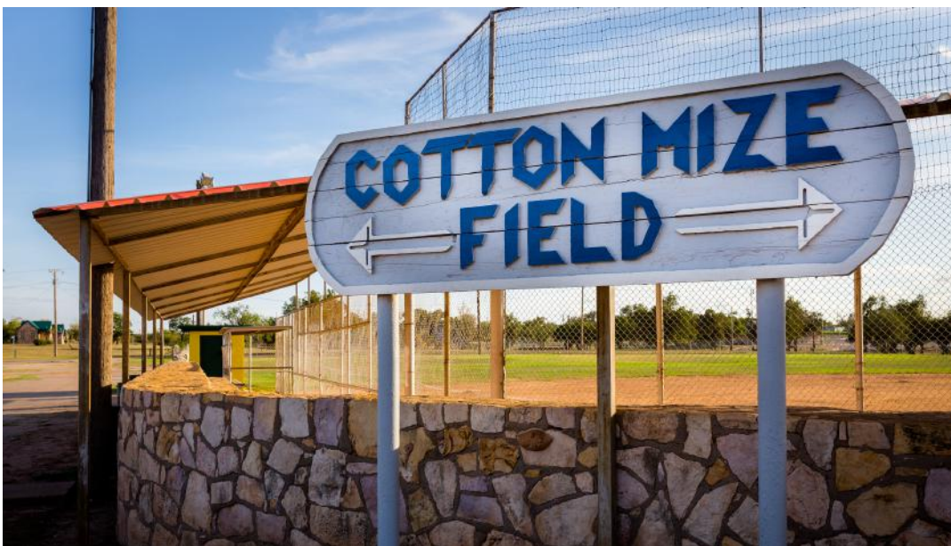
Field inside of Comanche Trail Park

While the City of Big Spring meets NPRA standards for community parks, the city falls short on standards for neighborhood and mini parks. Current standards recommend a minimum standard of 1.25 to 2.5 acres of parks land per 1,000 citizens. The City of Big Spring's current parks system includes approximately 1.1 acres per 1,000 citizens. Additionally, survey results indicate a community desire for additional neighborhood parks (as demonstrated in the survey). This need may be due in part to the pockets of residential areas not within the service area of a park as identified in Map #2 in the Appendix. Overall, Big Spring is not lacking in total park acreage due to the presence of the Big Spring State Park and Moss Creek Lake. Still, it is recognized that additional park construction should be evaluated as the community continues to grow.