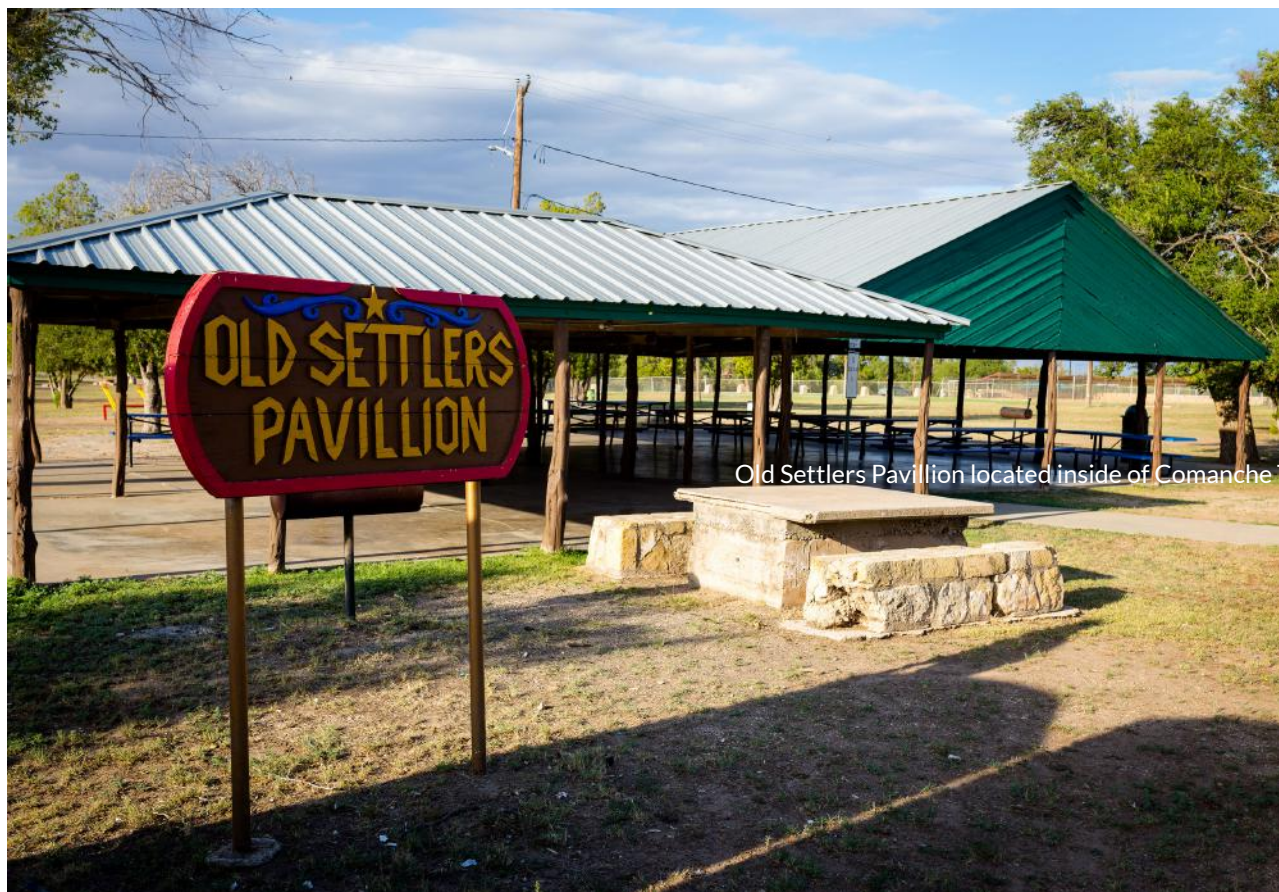
Old Settlers Pavillion located inside of Comanche T

Regional Parks: Regional parks are very large multi-use parks that serve several communities within a particular region. They range in size from 500 acres and above and serve those areas with a one hour driving distance. The regional park provides both active and passive recreation, with a wide selection of facilities for all age groups. They may also include areas of nature preservation for activities such as sight-seeing, nature study, wildlife habitat, and conservation areas. NRPA standards for regional parks vary due to the specific site and natural resources. Big Spring currently has two (2) regional parks, including the State park, totaling approximately 1,022 acres.