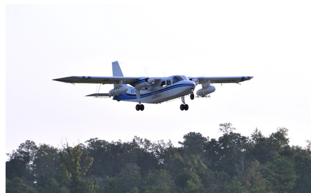
Airplane spraying either adulticide or larvicide onto targeted areas.

Because aerial spraying uses very low volumes of either adulticide or larvicide, you aren't likely to breathe or touch anything that has enough insecticide on it to harm you. There is a possibility that spraying larvicides, like Bti, or adulticides can cause eye irritation if a person is outside when spraying takes place.